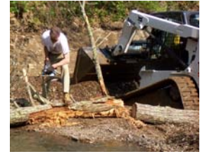
Warriors work with their tools at Camp Alkulana in Bath Co. VA.

Objective C: Provide opportunities for men to serve others through work projects in the community, region, state and beyond.