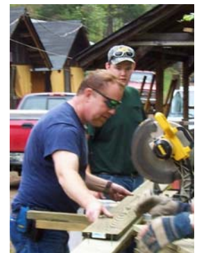
Two generations of Warriors work on a service project at Camp Alkulana.

“Encourage men to enter into deepening relationship with Christ in order to prepare themselves and future generations to think and act nobly.”