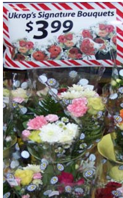
Five minutes and $5 buys a bouquet of happiness at Ukrops.

“If you want them to talk with you in the future, start now to make sure they know you will listen.”