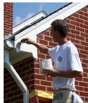
A warrior at work on our service project near Grange Hall School.