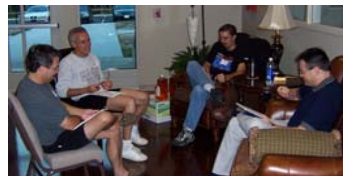
Processing material from The Quest for Authentic Manhood at Countryside Christian Church.

The ministry of Noble Warriors is picking up steam as we head into the fall. While there are still many organizational decisions to make and tasks to complete, the real work of the ministry, impacting men, is underway. Consider these statistics: **The Noble Notes mailing list is growing weekly. Nearly 200 individuals in at least three states receive the weekly devotional via e-mail. Based on comments I have received, many forward the file to friends and family.