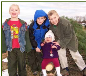
The YOUNG lumberjacks and lady celebrate after cutting down our Christmas tree!