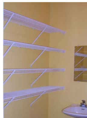
Noble Warriors helped coordinate installation of shelving at Commonwealth Clinic. Rearrangement of storage and other modifications will allow the clinic to better serve their dental patients.

LINK TO MAN2MAN EXPRESS VIA WWW.NOBLEWARRIORS.ORG TO HEAR THE DAILY BROADCASTS!