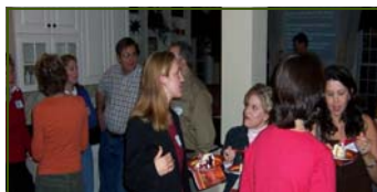
In addition to teaching/discussion time, the Enrichment events also feature dessert and fellowship.