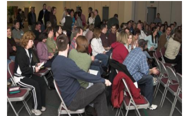
Over 70 couples participated in the Communication in Marriage Seminar on January 20 at Swift Creek Baptist Church.

Infusion Media Design produced a powerful promotional video for NW. (Check it out on the multimedia page of the website!) The