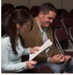
Couples share ideas and learn new strategies at the January Enrichment seminar on Communication in marriage.