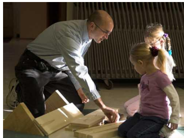
A dad prepares to build a manger with his daughters at Bethia UMC on Christmas Eve.

Be amazed! A pastor friend recently commented that he is concerned by the number of people (pastors specifically) who seem to be worn down and really don't expect God to do anything exciting anymore.